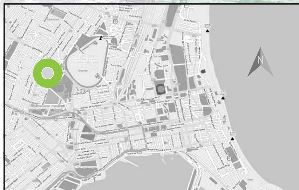
9A John Zikhali Road, Berea, Durban